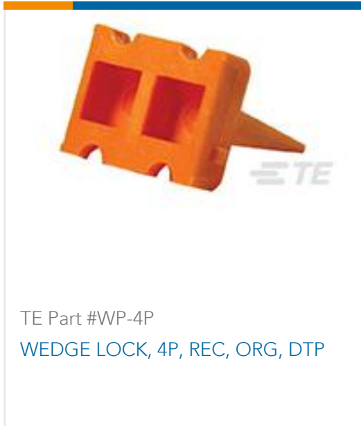
TE Part #WP-4P WEDGE LOCK, 4P, REC, ORG, DTP