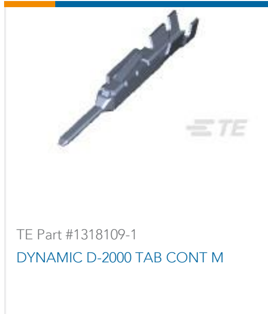
TE Part #1318109-1 DYNAMIC D-2000 TAB CONT M