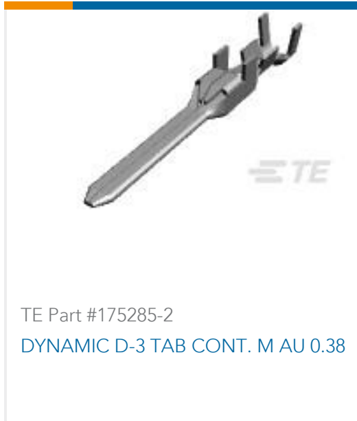
TE Part #175285-2 DYNAMIC D-3 TAB CONT. M AU 0.38