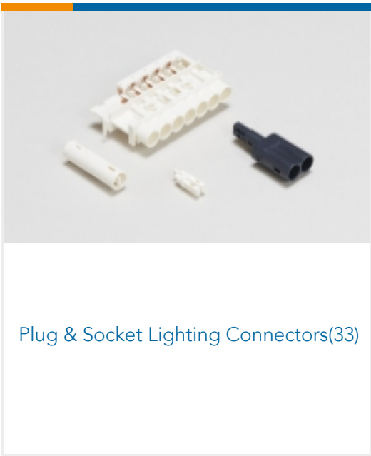
Plug & Socket Lighting Connectors(33)