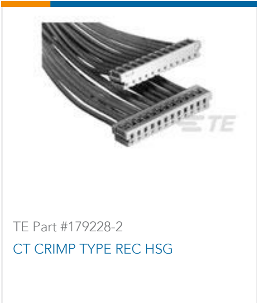
TE Part #179228-2 CT CRIMP TYPE REC HSG