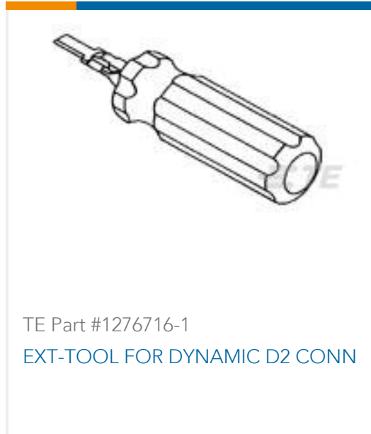
TE Part #1276716-1 EXT-TOOL FOR DYNAMIC D2 CONN

Assembly, Vertical SMT Header, 3-Positio