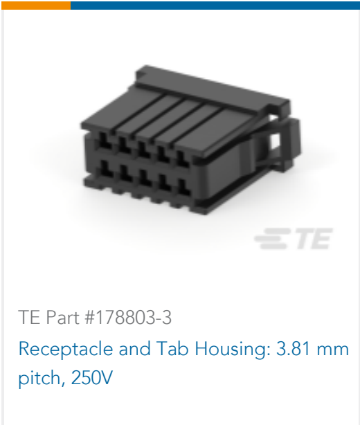
TE Part #178803-3 Receptacle and Tab Housing: 3.81 mm pitch, 250V