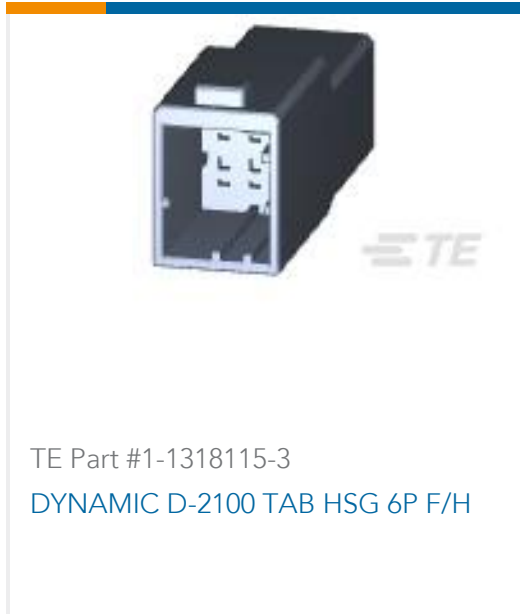
TE Part #1-1318115-3 DYNAMIC D-2100 TAB HSG 6P F/H