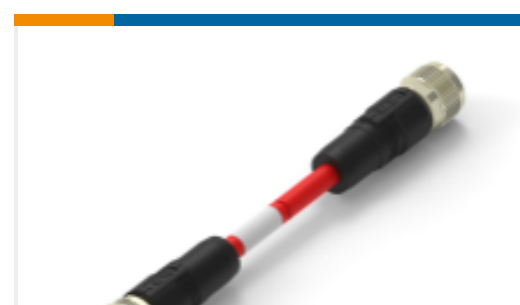
TE Part #TAA545B1411-060 M12A4-MS-FS-PVC-6.0M