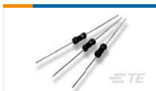
TE Part #4-1879350-2 RR01 5% 11R AMMO