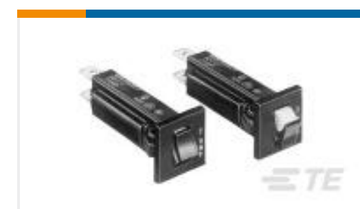
TE Part #1-1393250-7 W28-XQAT-15=W28