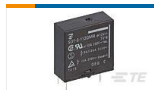
TE Part #8-1419125-5 SDT-S-106LMR,000