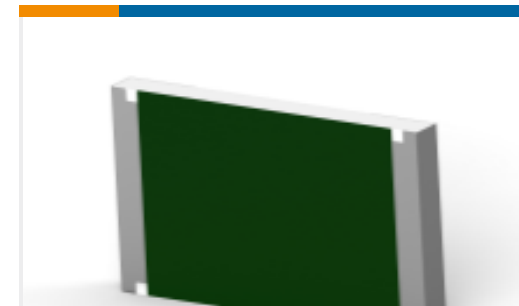
TE Part #8-2176407-8 3560 27R 5%