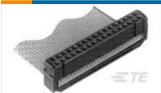
TE Part #1-1658623-0 50 NOVO MIL 30DP, LEAD FREE