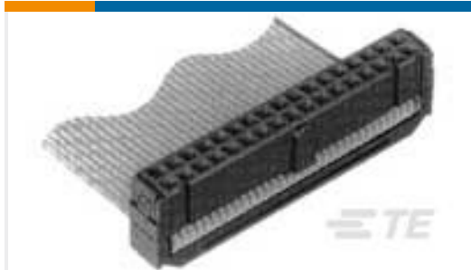
TE Part #1658622-1 10 NOVO MIL/CTR 30DP,LEAD FREE