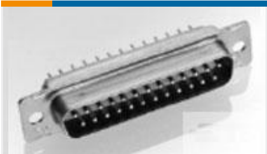
TE Part #207253-2 RECEPT ASSY,9 POSN,AMPLIMITE