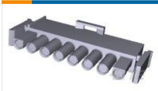
TE Part #640582-1 08P UMNL PLUG HSG