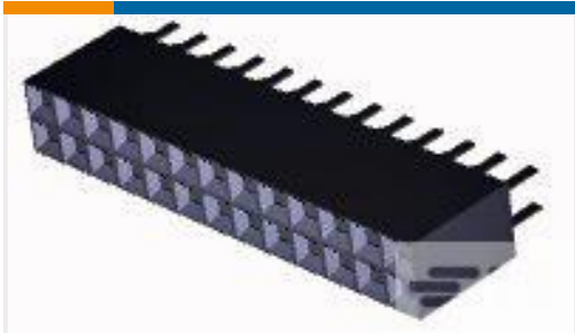
TE Part #6-534206-3 26 MODII VRT DR CE 100/115