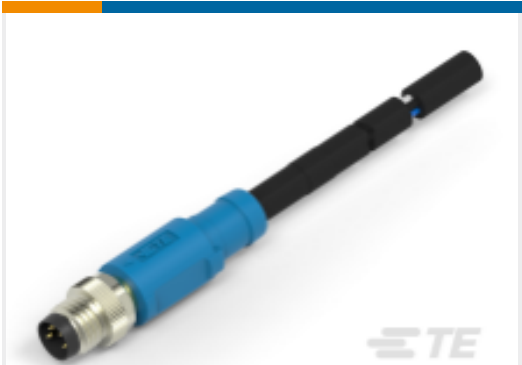
TE Part #T4061110004-004 M8 CABLE ST M 3M 4POS PVC CABLE