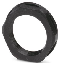
Nut (plastic), to lock the Pg29/SW 46 contact carrier

Please be informed that the data shown in this PDF document is generated from our online catalog. Please find the complete data in the user documentation. Our general terms of use for downloads are valid.