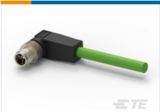
TE Part #TAX38225102-002 RPC-M12X-MR-8CON-PUR-1.0SH