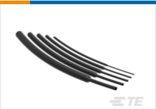
TE Part #EL88842001 VERSAFIT-1/4-0-STK