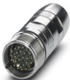
Contact carriers, M27, number of positions: 26, type of contact: Pin, Crimp

Please be informed that the data shown in this PDF Document is generated from our Online Catalog. Please find the complete data in the user's documentation. Our General Terms of Use for Downloads are valid ( http://phoenixcontact.com/download )