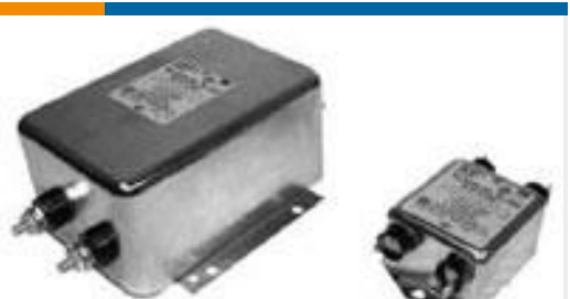
TE Part #1-6609037-2 6EMC1=F8127