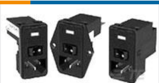
TE Part #5-6609107-4 PS0SXDS3A=C1111