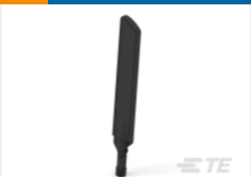
TE Part #DBA6171C4-BSMAM DIPOLE,SMAM,SWIVEL,617-7125MHz, OUTDOOR