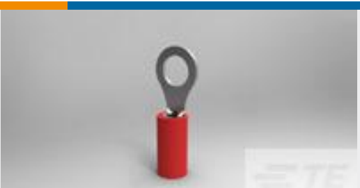
TE Part #36154 PIDG R 22-16 COMM 22-18 MIL 10