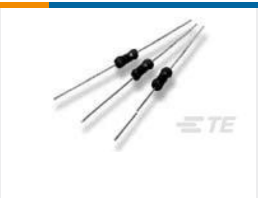
TE Part #4-1625892-6 3W SM M/OX 5% 39R