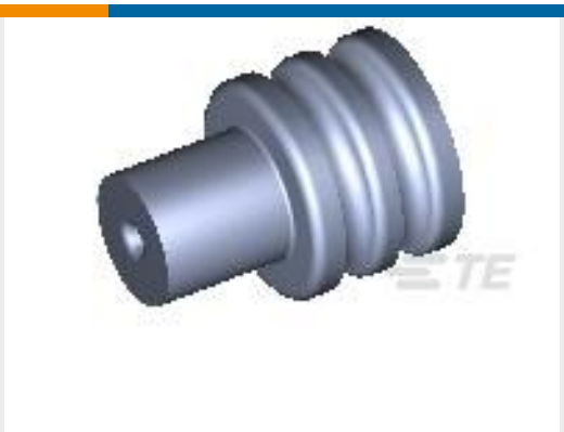
TE Part #963294-1 SINGLE WIRE SEAL INSULATION DI