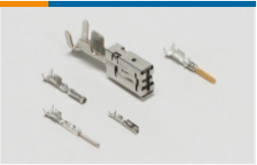
Automotive Terminals (189)