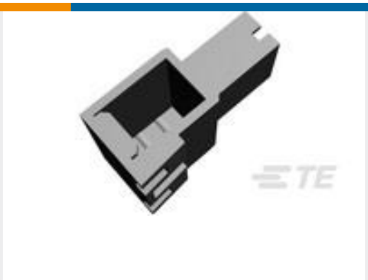
TE Part #344160-1 R/ANGLE POS.LOK.Boot