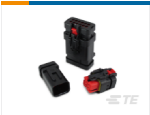
TE Part #776531-2 AMPSEAL 16 Housings