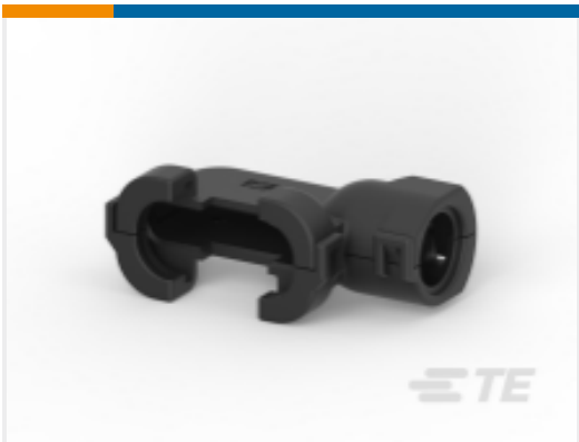
TE Part #2272163-1 MCON WIRE DRESS, 4P, RIGHT ANGLE