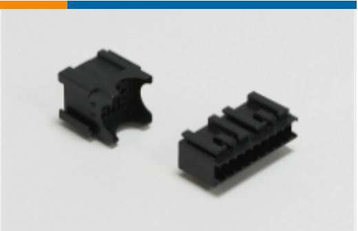
Module Components (1)