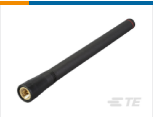
TE Part #ANT-433-CW-HW-SMA Antenna 1/4 Wave Whip 433MHz SMA