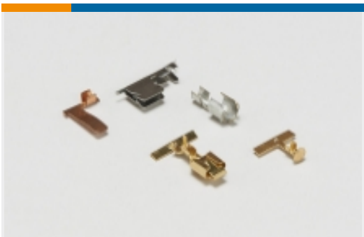
Special Purpose Terminals (2)