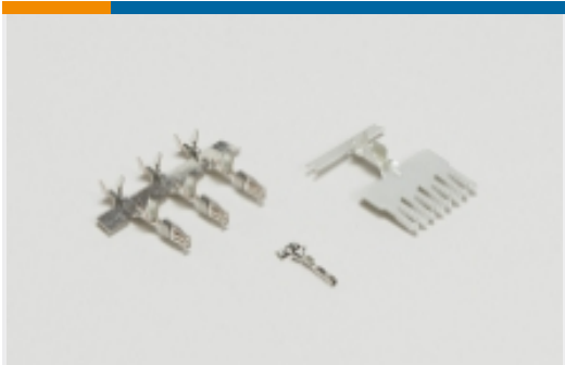
Busbars & Terminals (1)