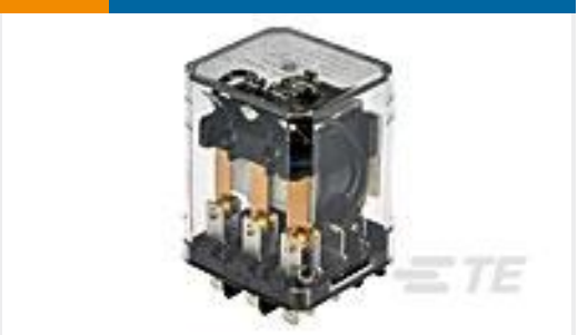
TE Part #2-1393117-9 KUP-11A55-120=KU