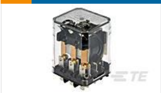
TE Part #2-1393117-2 KUP-11A15-240=KU