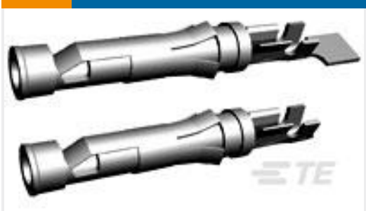
TE Part #66598-2 III+ SKT,18-14,30AU/FL,STRIP