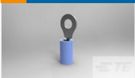
TE Part #53941-2 TERMINAL,PIDG R 16-14 8