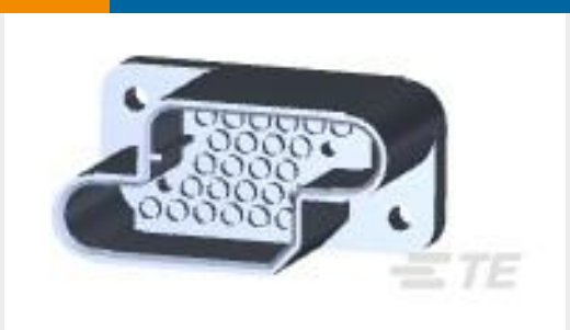
TE Part #211149-1 PIN HSG,25 POSN,METRIMATE