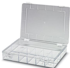
Assortment box, 8 compartments

https://www.phoenixcontact.com/us/products/5145180