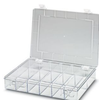
Assortment box, 12 compartments external dimensions 335 x 225 x 55 mm, material: Polystyrene

https://www.phoenixcontact.com/us/products/5020658