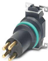
Sample set, 4-position, Pin, straight, M8, coding: A, PCB mounting, SMD, Alternative product in accordance with RoHS II without Exemption 6c (Pb < 0.1 %) item no.: 1239221

Please be informed that the data shown in this PDF document is generated from our online catalog. Please find the complete data in the user documentation. Our general terms of use for downloads are valid.