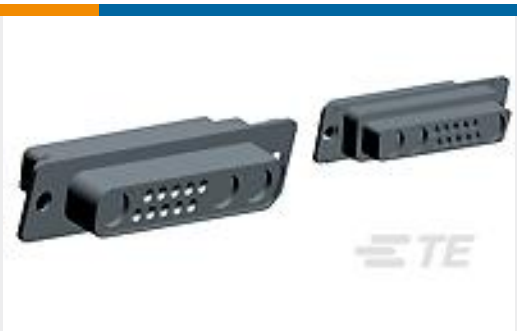
TE Part #208811-1 RECEPT ASSY,COAX MIX,AMPLIMITE