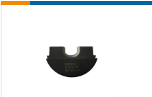
TE Part #1-1490413-6 NEST, 90 DEG SOLISTRAND, 4