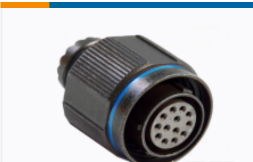
TE Part #YDTS26F21-35SDC001 PLUG ASSY