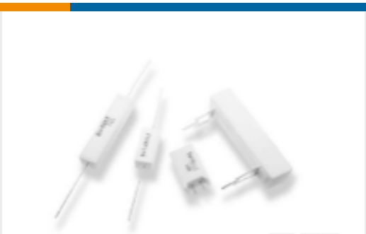
TE Part #1623795-9 Wirewound Resistor: Horizontal Mount