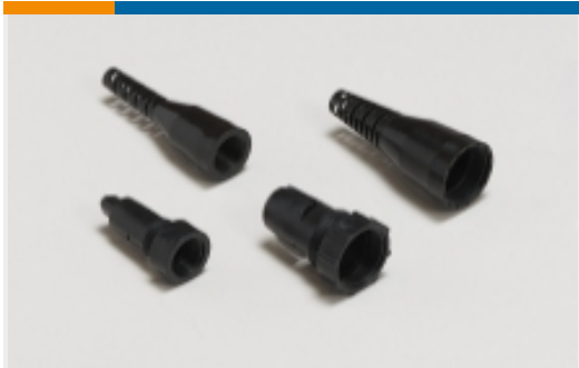
Connector Strain Relief(60)