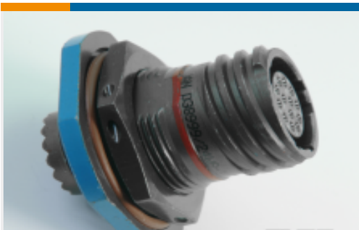
TE Part #YDTS24F15-18SNV001 RECP ASSY