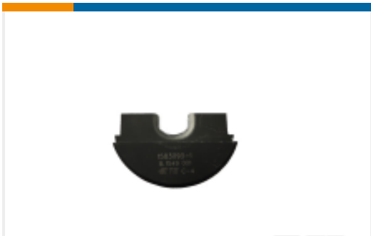
TE Part #1-1490413-8 NEST, 90 DEG SOLISTRAND1/0