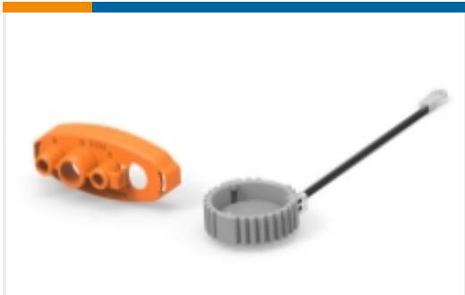
Connector Caps & Covers(19)