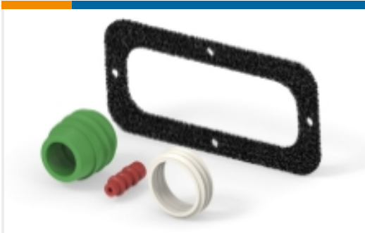
Connector Seals & Cavity Plugs(36)