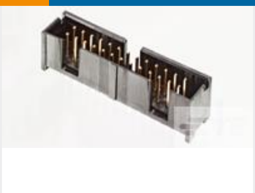
TE Part #1761681-6 IDC LOW PRO HDR 16P VERT HT BLACK