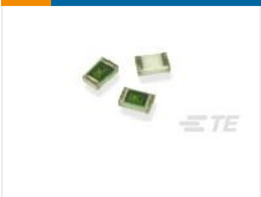
TE Part #1676153-1 RN 0805 10K 0.1% 10PPM CUT LENGTH