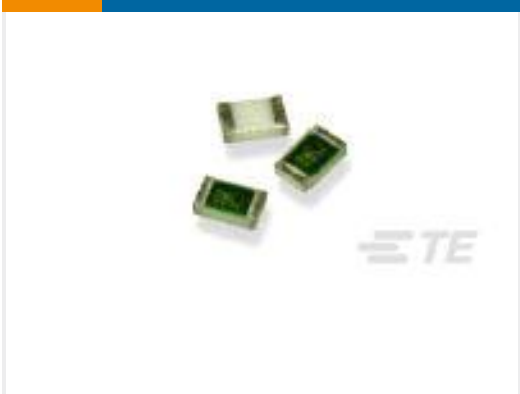
TE Part #1614885-4 CPF 0805 68K 0.1% 25PPM 1K RL