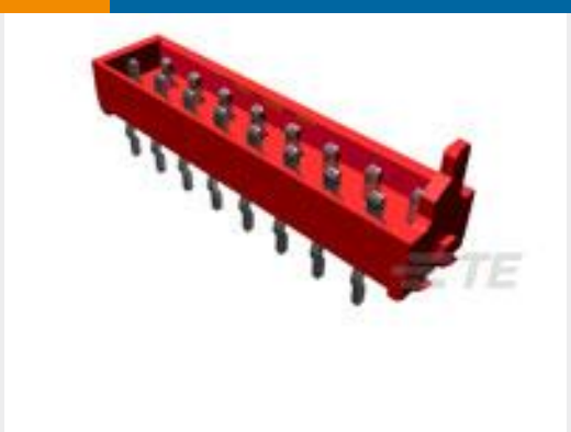
TE Part #8-215464-8 18P.MICRO-MATCH MOB