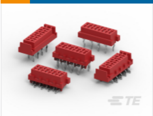
TE Part #8-215079-0 Female-on-Board Connector, Top Entry