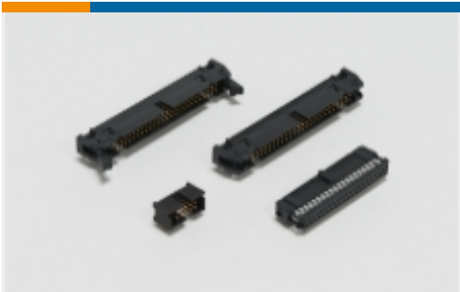
Ribbon Cable Connectors(186)