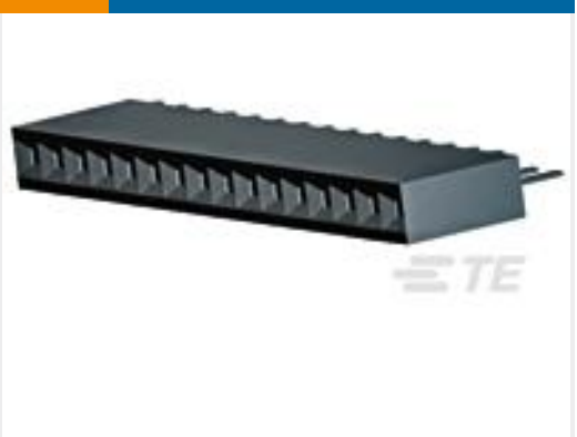
TE Part #6-534237-4 16 MODII VRT SR CE 100/115