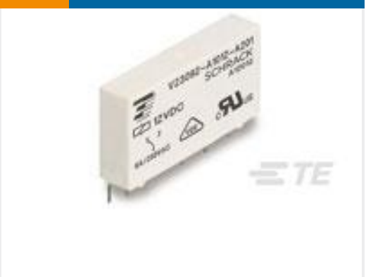
TE Part #1393236-2 V23092-A1005-A301