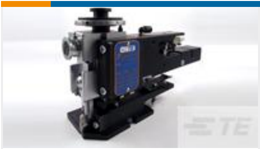
TE Part #2150198-2 OCEAN_2.0_Applicator-E-210F250O-REA