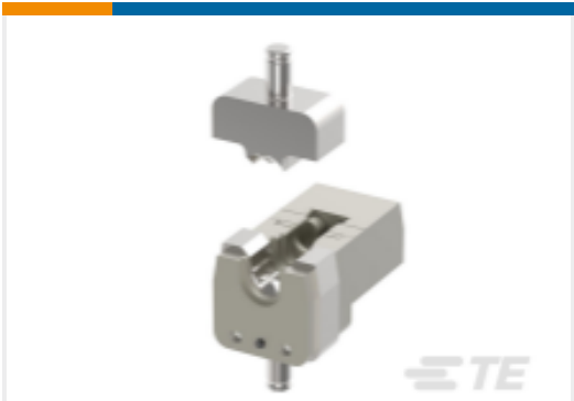
TE Part #2326578-1 DIE SET HVP 800-90-2/3P F 50MM2