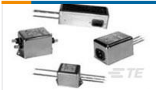
TE Part #6609048-5 6EQ1=F7262 S0