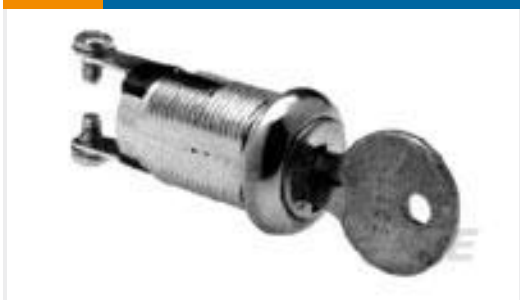
TE Part #2-1437597-7 2SWK231AL101=non ul keylock