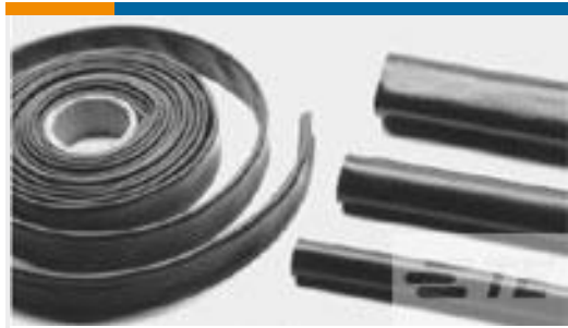
TE Part #CB5052-000 BSTS-17X4