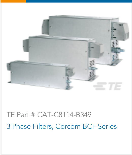
TE Part # CAT-C8114-B349 3 Phase Filters, Corcom BCF Series

This information is provided based on reasonable inquiry of our suppliers and represents our current actual knowledge based on the information they provided. This information is subject to change. The part numbers that TE has identified as EU RoHS compliant have a maximum concentration of 0.1% by weight in homogenous materials for lead, hexavalent chromium, mercury, PBB, PBDE, DBP, BBP, DEHP, DIBP, and 0.01% for cadmium, or qualify for an exemption to these limits as defined in the Annexes of Directive 2011/65/EU (RoHS2). Finished electrical and electronic equipment products will be CE marked as required by Directive 2011/65/EU. Components may not be CE marked. Additionally, the part numbers that TE has identified as EU ELV compliant have a maximum concentration of 0.1% by weight in homogenous materials for lead, hexavalent chromium, and mercury, and 0.01% for cadmium, or qualify for an exemption to these limits as defined in the Annexes of Directive 2000/53/EC (ELV). Regarding the REACH Regulation, the information TE provides on SVHC in articles for this part number is based on the latest European Chemicals Agency (ECHA) 'Guidance on requirements for substances in articles' posted at this URL: https://echa.europa.eu/guidance-documents/guidance-on-reach