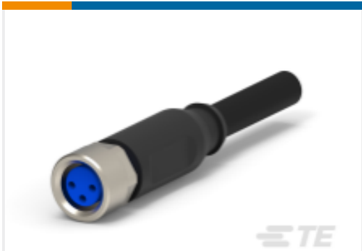
TE Part #1-2273001-1 M8 Straight Pigtail, Female