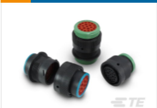
TE Part #HDP26-18-6SN DEUTSCH HDP20 Housings