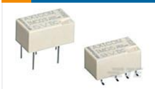
TE Part #1462042-3 IMC06GR=IM RELAY 140mW 12V 1CO