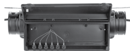
3M™ SLiC™ Fiber Aerial Terminal Closure 530

The SLiC fiber aerial terminal closure is an aerial, strand mount, free breathing (breathable) fiber terminal for FTTP (fiber to the premises) applications. It is designed to be used for inline, taut sheath and butt splicing configurations.