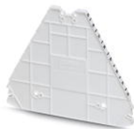
End cover, length: 100 mm, width: 2.2 mm, height: 80.8 mm, color: white

Please be informed that the data shown in this PDF Document is generated from our Online Catalog. Please find the complete data in the user's documentation. Our General Terms of Use for Downloads are valid ( http://phoenixcontact.com/download )