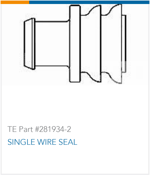
TE Part #281934-2 SINGLE WIRE SEAL