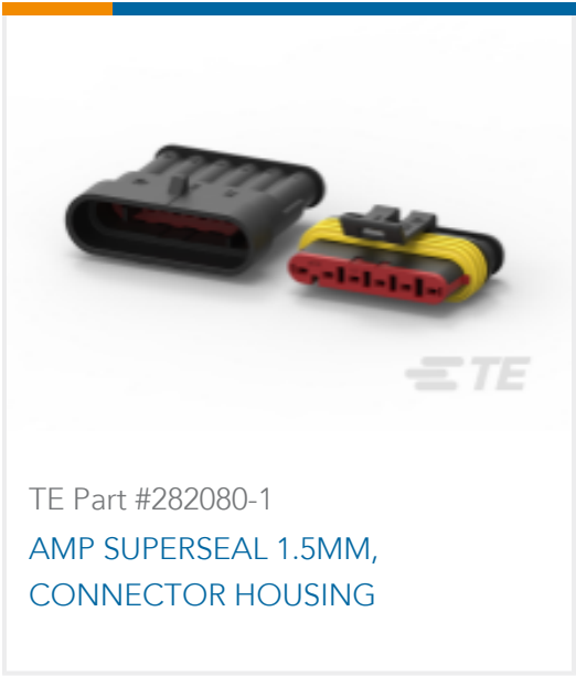
TE Part #282080-1 AMP SUPERSEAL 1.5MM, CONNECTOR HOUSING