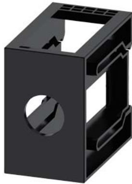
Adapter for DIN rail mounting Black, for command devices, 22 mm, round