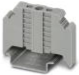
End clamp, width: 9.5 mm, color: gray