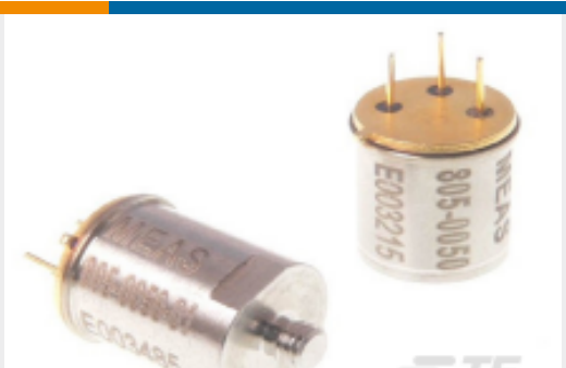
TE Part #805-0050 805-0050 TO-5 Accelerometer