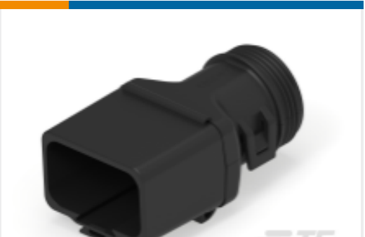
TE Part #1011-249-1205 BKSHL, 12P, BLK, REC,ST, NW10/13/17