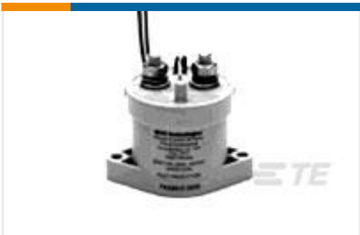
TE Part #1618002-5 EV200AAACA=RELAY, EV200 SPST-N