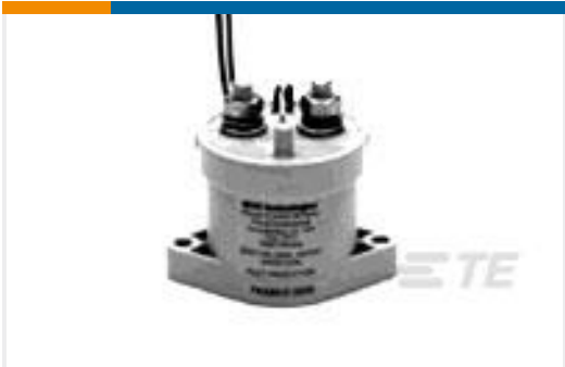
TE Part #1-1618002-8 EV200HAANA=RELAY, SPST-NO WITH