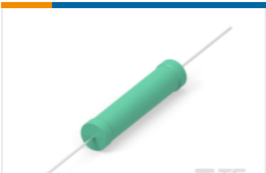
TE Part #2-2176614-5 EP 10W (SS) 10R 5% BULK BOX