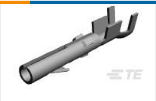
TE Part #163304-4 SOCKET MATEN-LOK