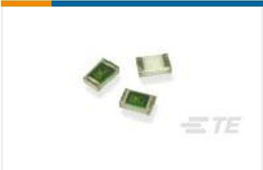
TE Part #6-2176093-7 RP 2A 0.25W 51K1 0.1% 25PPM 1K RL