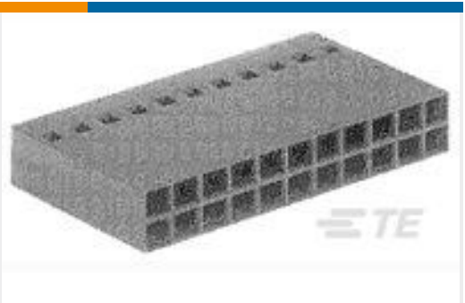
TE Part #104482-9 20 SHORT PT RCPT HSG DR .100CL