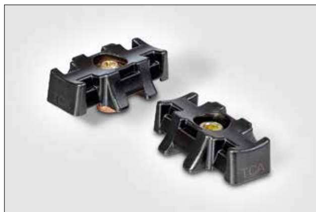
S3SB15CBM8 and S3CBM8.

Exemplary illustration of a possible 3-way transfer