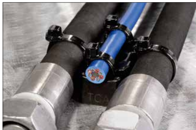
S3CBM8 in combination with our X-Series.