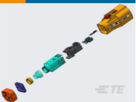
TE Part #YHVA630-2PHM-6MM-A HVA630-2phm,6sqmm,Key A