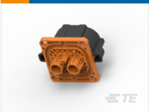
TE Part #1-2141227-1 2POS,PIN DIA 8.0,PIN HSG,ASSY,SLD