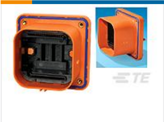
TE Part #1-1587987-7 RECEPTACLE ASSEMBLY, Shunt, MSD