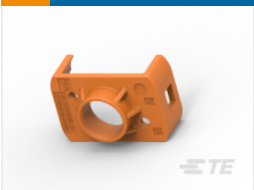
TE Part #2141155-3 PROTEC. COVER 8MM HV,90DEG