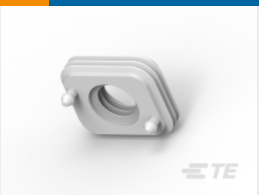
TE Part #2141156-3 SWS,8MM HV,WHT,25 SQMM