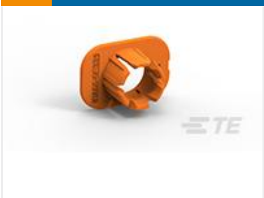
TE Part #2103155-1 COLLET, SIZE 1, HVA280