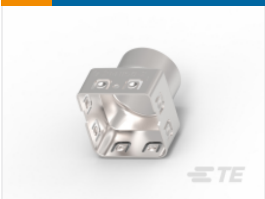
TE Part #9-2141158-2 CU ALLOY,SHIELD,8MM HV,CONN HSG,90 DEG