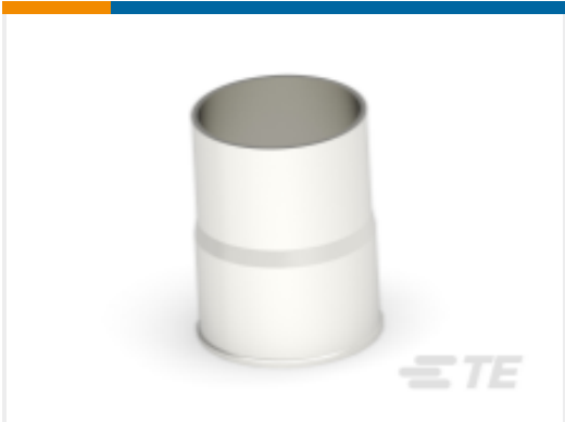
TE Part #2310222-1 CU ALLOY,OUTER FERRULE,PCON12