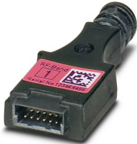
Radioline - configuration stick for easy and safe network addressing for the 868 MHz wireless module (RAD-868-...), unique network ID, RF band 1

Please be informed that the data shown in this PDF document is generated from our online catalog. Please find the complete data in the user documentation. Our general terms of use for downloads are valid.