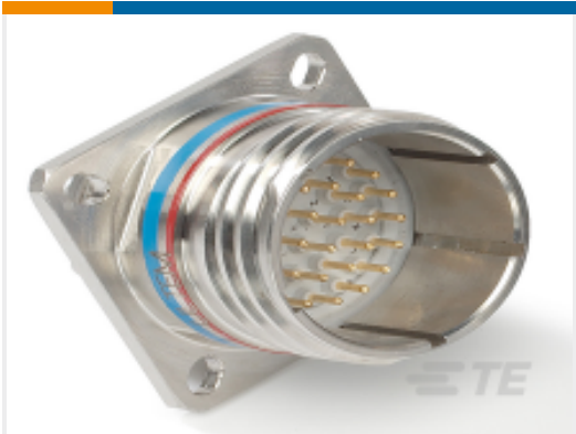
TE Part # CAT-D38999-DTS6X D38999: Square Flange, 19-35 insert