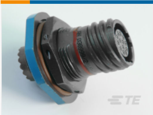
TE Part # CAT-D38999-DTS15P Jam Nut: D38999, 19-35 Insert

This information is provided based on reasonable inquiry of our suppliers and represents our current actual knowledge based on the information they provided. This information is subject to change. The part numbers that TE has identified as EU RoHS compliant have a maximum concentration of 0.1% by weight in homogenous materials for lead, hexavalent chromium, mercury, PBB, PBDE, DBP, BBP, DEHP, DIBP, and 0.01% for cadmium, or qualify for an exemption to these limits as defined in the Annexes of Directive 2011/65/EU (RoHS2). Finished electrical and electronic equipment products will be CE marked as required by Directive 2011/65/EU. Components may not be CE marked. Additionally, the part numbers that TE has identified as EU ELV compliant have a maximum concentration of 0.1% by weight in homogenous materials for lead, hexavalent chromium, and mercury, and 0.01% for cadmium, or qualify for an exemption to these limits as defined in the Annexes of Directive 2000/53/EC (ELV). Regarding the REACH Regulation, the information TE provides on SVHC in articles for this part number is based on the latest European Chemicals Agency (ECHA) 'Guidance on requirements for substances in articles' posted at this URL: https://echa.europa.eu/guidance-documents/guidance-on-reach