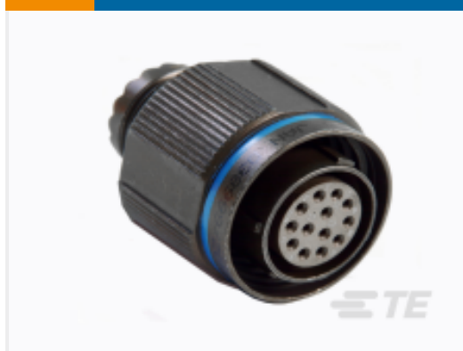
TE Part #YDTS26W13-35SNV001 PLUG ASSY