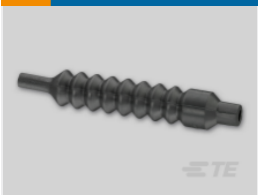
TE Part #806252-000 Convoluted Heat Shrink Uni Boots: Lipped, Straight