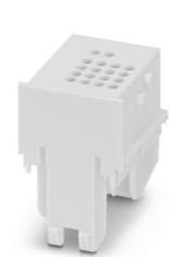
DIN rail housing, 2U for marking lid, Housing cover, width: 18.9 mm, height: 21.9 mm, depth: 26 mm, color: light gray (similar RAL 7035)

Please be informed that the data shown in this PDF document is generated from our online catalog. Please find the complete data in the user documentation. Our general terms of use for downloads are valid.