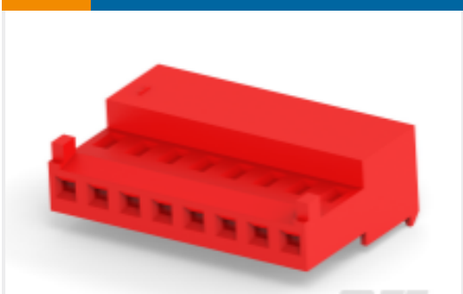
TE Part #3-644042-4 Nylon Gold Plated Receptacle: 2.54 mm, with Mating Alignment, MTA 100