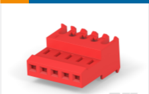
TE Part #3-641191-2 Nylon Gold Plated Receptacle: 2.54 mm, no Mating Alignment