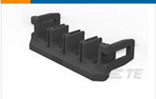
TE Part #1971777-4 PTL TPA HIGH TEMP 1 x 4 BLACK