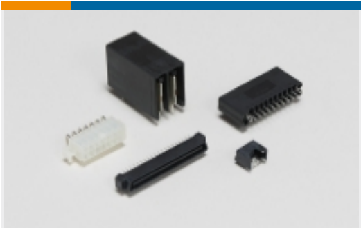
Standard Rectangular Connectors(495)