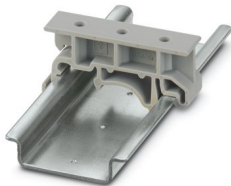
Rail adapter, for M3 screws, depth: 7.4 mm, width: 10 mm, height: 42.6 mm, diameter: 2.8 mm, color: gray, mounting type: Plug-on assembly

Please be informed that the data shown in this PDF document is generated from our online catalog. Please find the complete data in the user documentation. Our general terms of use for downloads are valid.