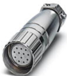
Cable connector, with Pg13.5 connection thread, straight, shielded: yes, Screw locking, M23, cable diameter range: 3 mm ... 10.5 mm

Please be informed that the data shown in this PDF Document is generated from our Online Catalog. Please find the complete data in the user's documentation. Our General Terms of Use for Downloads are valid ( http://phoenixcontact.com/download )