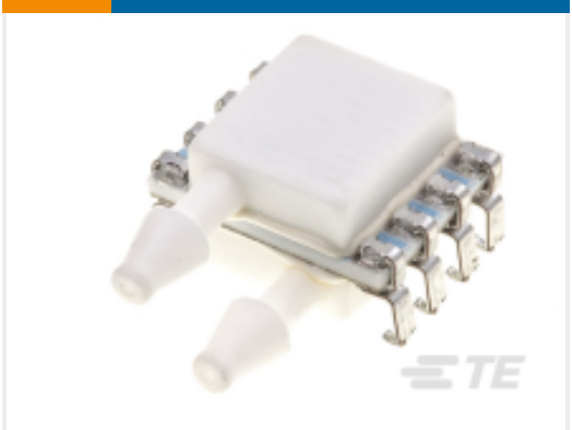
TE Part #4525DO-DS5AI015DP PRESS XDCR,DIGITAL,PSI RANGE