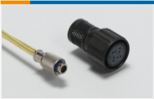
Standard Circular Connectors(9180)