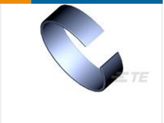
TE Part #745508-4 FERRULE SPLIT RING, HD