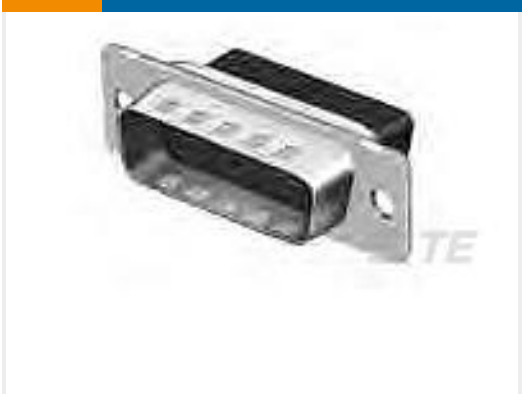
TE Part #167296-1 50P.HDP20 PLUG ASSY