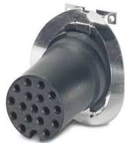
Sample set, 17-position, Socket, straight, M12, coding: A, PCB mounting, SMD, Alternative product in accordance with RoHS II without Exemption 6c (Pb < 0.1 %) item no.: 1239205

Please be informed that the data shown in this PDF document is generated from our online catalog. Please find the complete data in the user documentation. Our general terms of use for downloads are valid.