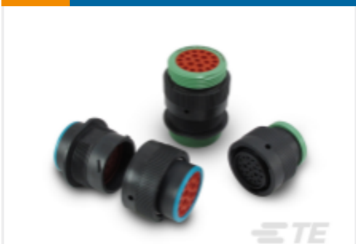
TE Part #HDP24-24-47SE-L015 DEUTSCH HDP20 Housings