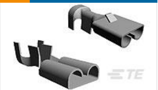
TE Part #5-160526-9 FF 250 REC 0.5-1.5MM2 TPPB