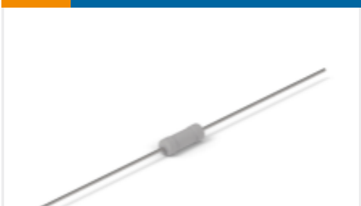
TE Part #7-1676123-5 1/2W SM M/OX 5% 1K0