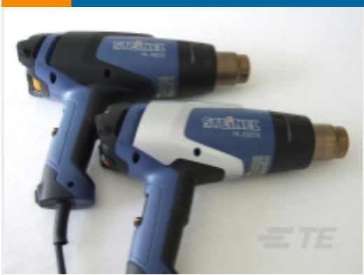
TE Part # EG8162-000 HL1920E-230V-EURO

numbers that TE has identified as EU ELV compliant have a maximum concentration of 0.1% by weight in homogenous materials for lead, hexavalent chromium, and mercury, and 0.01% for cadmium, or qualify for an exemption to these limits as defined in the Annexes of Directive 2000/53/EC (ELV). Regarding the REACH Regulation, the information TE provides on SVHC in articles for this part number is based on the latest European Chemicals Agency (ECHA) ‘Guidance on requirements for substances in articles’ posted at this URL: https://echa.europa.eu/guidance-documents/guidance-on-reach