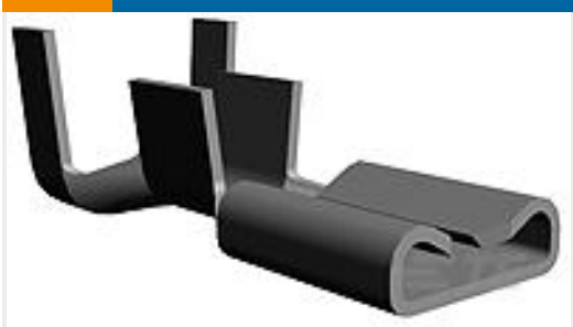
TE Part #42799-1 187 FASTON REC 20-16 AWG BR