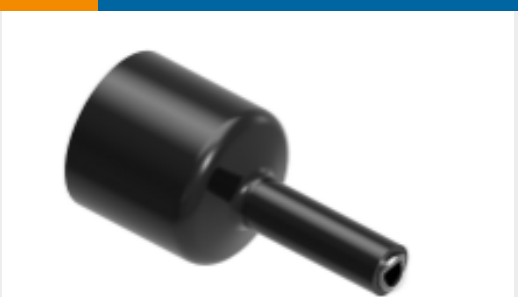
TE Part #NB07752001 HTAT-24/6-0-STK