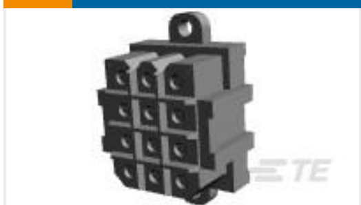
TE Part #207528-7 SKT HDR ASSY,12 POSN,METRIMATE