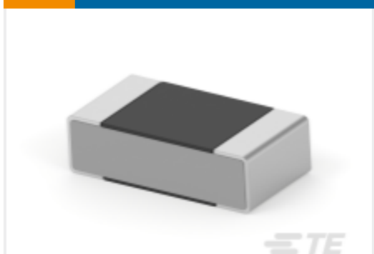
TE Part #7-1879140-1 RN 0603 100K 0.1% 10PPM 5K RL 094 TR