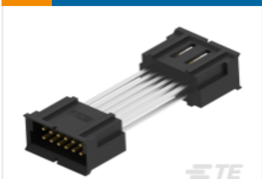
TE Part #364099-E DRCBTB 1,27 12 M BTB30 28,2 137 * 094 TR