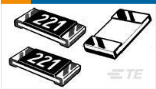
TE Part #8-2176231-7 3522 39K 1% 3W