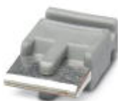
Single plug-in bridge, length: 6 mm, number of positions: 2, color: gray

Single plug-in bridge - FBST 6-PLC GY - 2966825