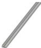
Continuous plug-in bridge, length: 500 mm, color: gray

Continuous plug-in bridge - FBST 500-PLC GY - 2966838