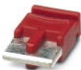
Single plug-in bridge, length: 6 mm, number of positions: 2, color: red

Single plug-in bridge - FBST 6-PLC RD - 2966236