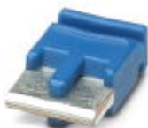
Single plug-in bridge, length: 6 mm, number of positions: 2, color: blue

Single plug-in bridge - FBST 6-PLC BU - 2966812