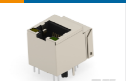
TE Part #203342-E MJIM IMV 1X1 S 810 * X R THRU * L1A M5B0