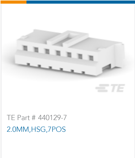
TE Part # 440129-7 2.0MM,HSG,7POS