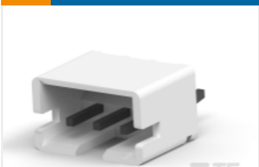
TE Part #1-1775470-0 AMP HPI 2.0 mm Headers