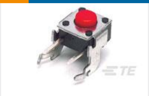
TE Part #1571610-1 Sealed R/A Tact switch, Sealed