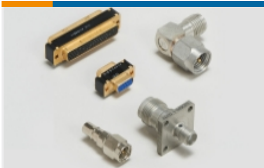
Connector Adapters & Connector Savers(8)