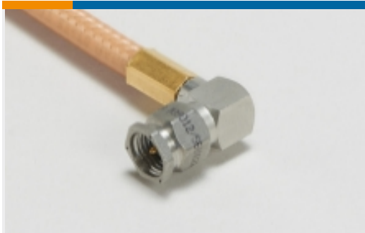
RF Cable Assemblies(2)