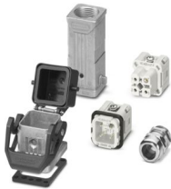
Connector set, consisting of: D7 sleeve housing and panel mounting base, 3-pos. plug and socket insert, M20 cable gland

Please be informed that the data shown in this PDF document is generated from our online catalog. Please find the complete data in the user documentation. Our general terms of use for downloads are valid.