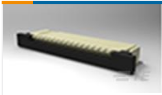
TE Part # 1-84953-7 1MM FPC HORZ.TOP CONT.ASSY 17P