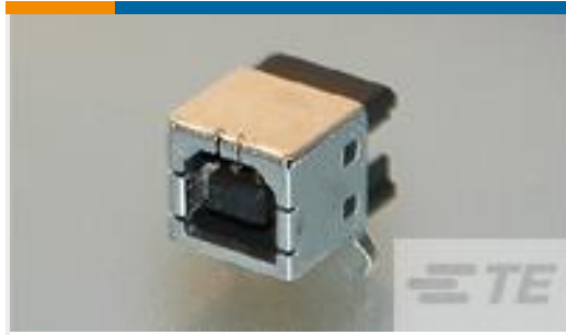
TE Part #292304-1 STD USB TYPE B, R/A, T/H