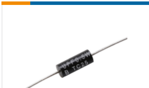
TE Part #2176163-9 UPF50 0.1% 5PPM 20R