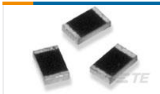
TE Part #1879808-1 RP 1J 1K0 0.1% 15PPM 5K RL