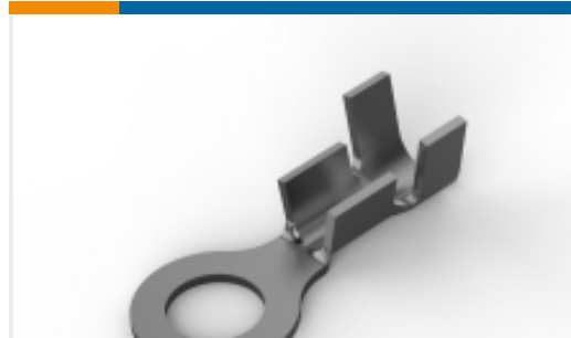
TE Part #440456-1 RING TERMINAL, TPBR