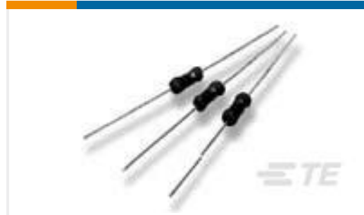
TE Part #4-1625890-5 2W SM M/OX 5% 39K