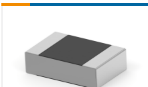
TE Part #5-2176264-9 RN 0805 4R75 0.1% 10PPM 1K RL