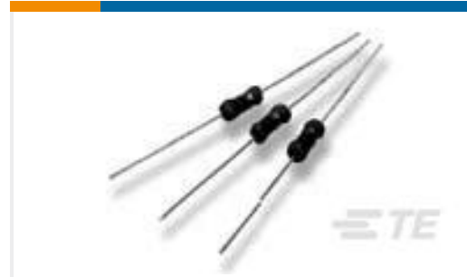
TE Part #9-1625892-3 3W SM M/OX 5% R15