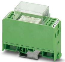
Relay module, with soldered-in miniature switching relay, contact (AgNi+Au): small to large loads, 1 changeover contact, input voltage 230 V AC/DC

Please be informed that the data shown in this PDF document is generated from our online catalog. Please find the complete data in the user documentation. Our general terms of use for downloads are valid.