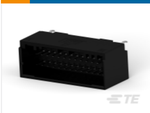
TE Part #1-2329463-4 DYNAMIC 1100D HDR ASSY V 28P XBLACK TIN