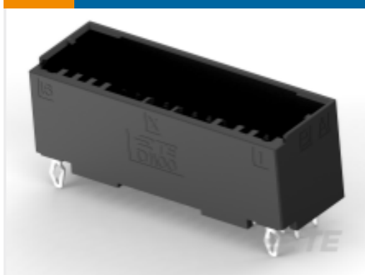
TE Part #1-2329463-6 DYNAMIC 1100D HDR ASSY V 32P XBLACK TIN