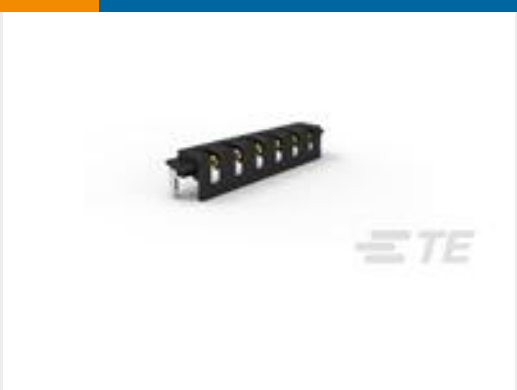
TE Part #1932869-2 FBIS-II REC ASSY 6 POS, 1.27um Gold