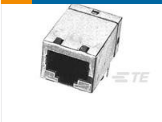
TE Part #1-1734264-1 M/J,RJ45,Side entry,8P8C,R/A,1