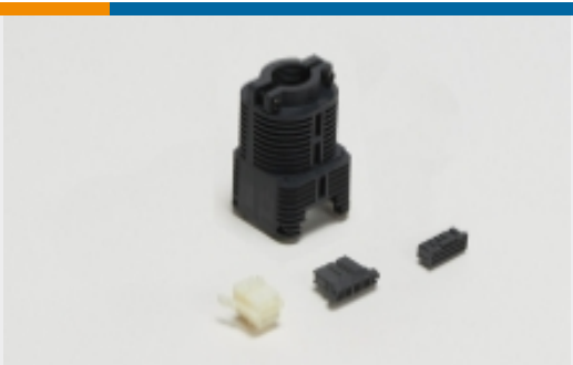
Rectangular Connector Housings(2)