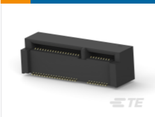
TE Part #1759513-1 0.8MM MINI PCI EXPRESS CONNECTOR 9H