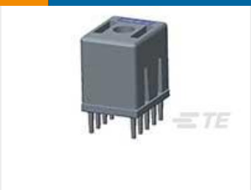
TE Part #6643264-1 ICCON,SKT,ASSY