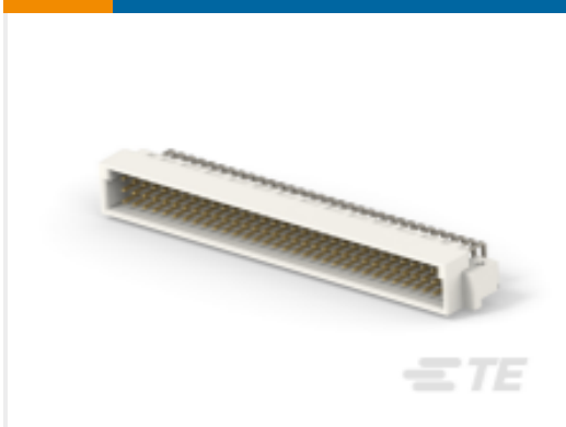
TE Part #4-2271013-0 CELLO,PIN,96P,TH,RA,FG,DIP3.0,-