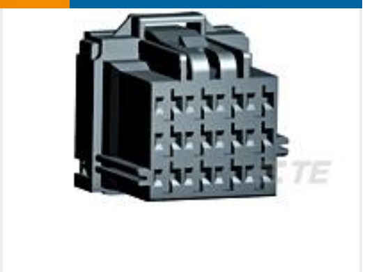
TE Part #4-968972-1 MCP2,8 GEH ASSY 12P