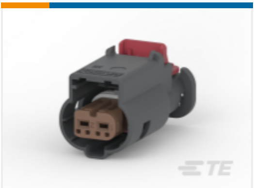
TE Part #5-2297790-2 2POS,HPF 1.2,REC HSG,ASSY,SLD