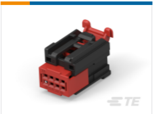
TE Part #1456987-1 2x4 Fem unsealed LP assy Key A