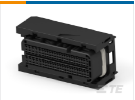
TE Part #2359943-2 96POS,MCON-1.2 CB,REC HSG,ASSY