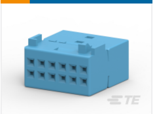
TE Part #2278598-1 12POS MOS REC