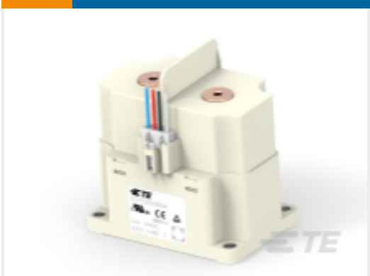
TE Part #2071568-2 ECP150BHBADA