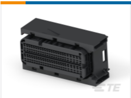
TE Part #8-1564284-5 96POS,MCON-1.2 CB,REC HSG,ASSY