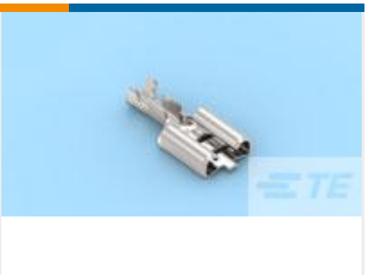
TE Part #444156-4 .250 FASTON REC.