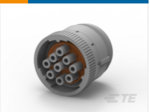
TE Part #HD16-9-96SE PLG, 9P, GRY, E, THRD, 16