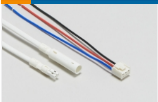
Power Cable Assemblies(1)