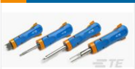
TE Part #1-1579007-7 EXTRACTION TOOL