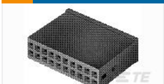
TE Part #87133-8 06 LOCKING CLIP HSG DR MRKD