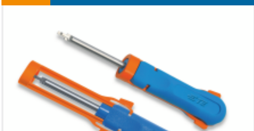
TE Part #8-1579008-4 EXTRACTION TOOL