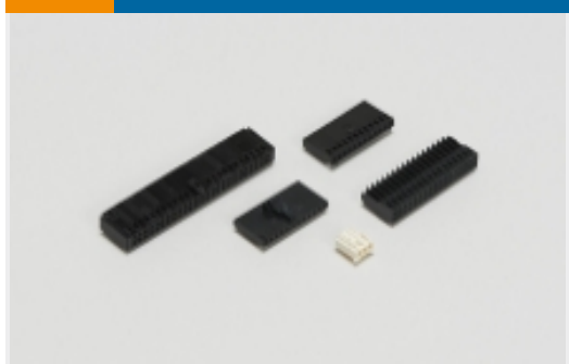
Wire-to-Board Connector Assemblies & Housings(77)