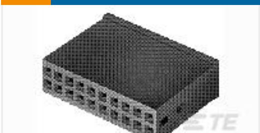
TE Part #87133-9 08 LOCKING CLIP HSG DR .100CL