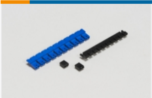
Board-to-Board Jumpers & Shunts(4)