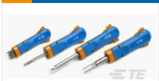
TE Part #3-1579007-9 EXTRACTION TOOL