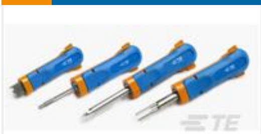
TE Part #6-1579007-2 EXTRACTION TOOL