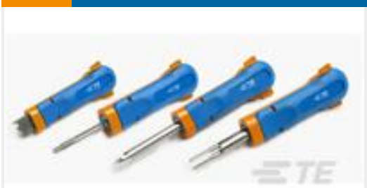
TE Part #1579007-8 EXTRACTION TOOL