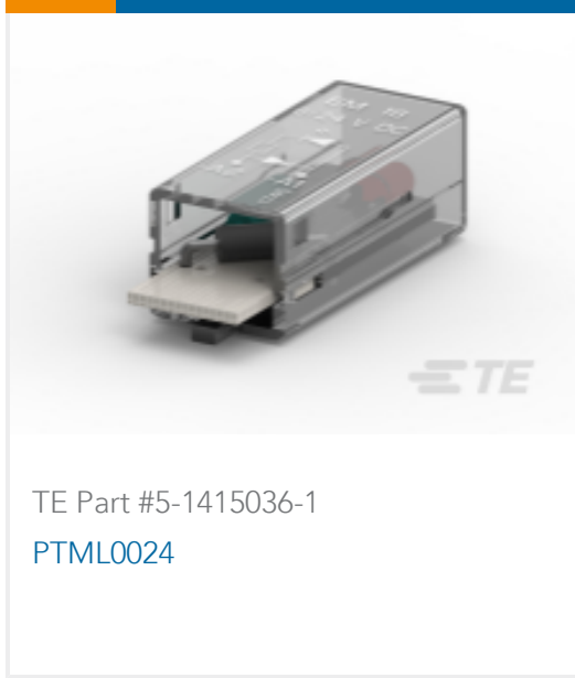
TE Part #5-1415036-1 PTML0024