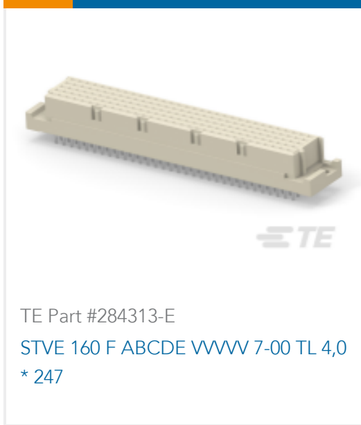
TE Part #284313-E STVE 160 F ABCDE VVVV 7-00 TL 4,0 * 247