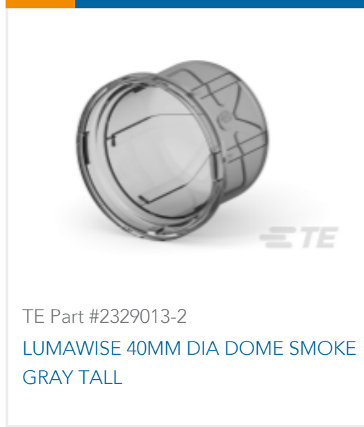
TE Part #2329013-2 LUMAWISE 40MM DIA DOME SMOKE GRAY TALL