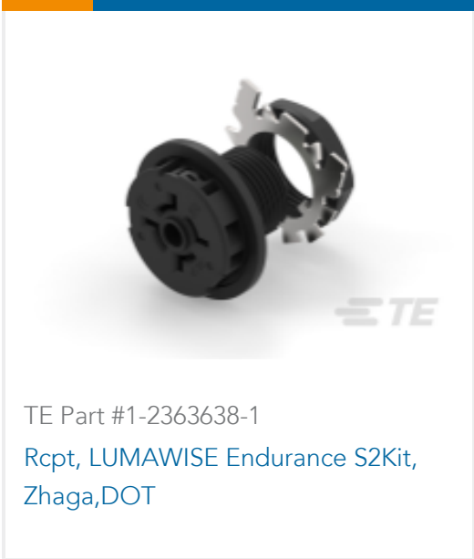
TE Part #1-2363638-1 Rcpt, LUMAWISE Endurance S2Kit, Zhaga, DOT