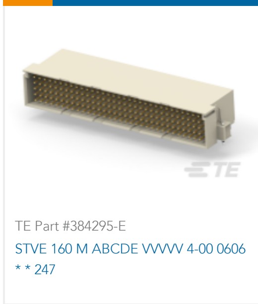
TE Part #384295-E STVE 160 M ABCDE VVVV 4-00 0606 * * 247