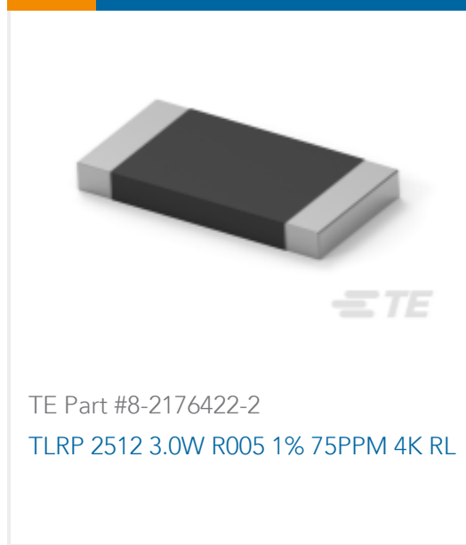
TE Part #8-2176422-2 TLRP 2512 3.0W R005 1% 75PPM 4K RL