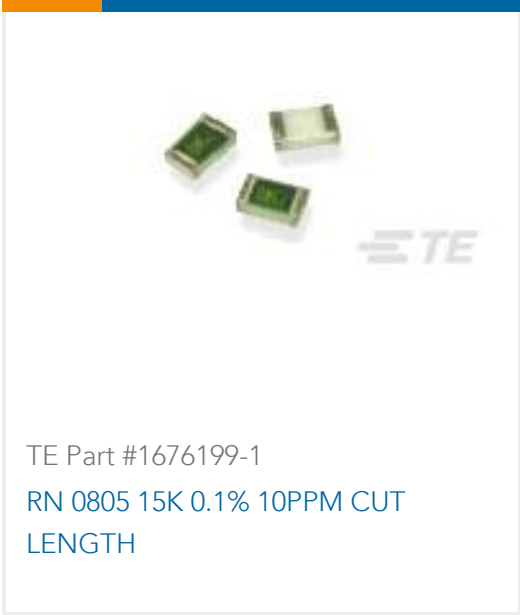
TE Part #1676199-1 RN 0805 15K 0.1% 10PPM CUT LENGTH