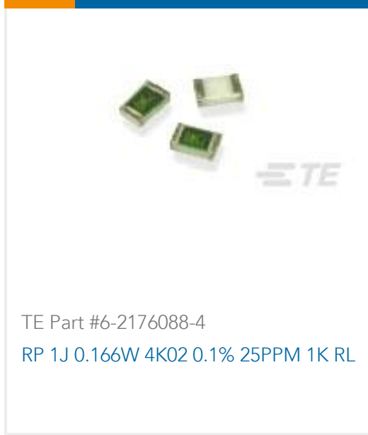
TE Part #6-2176088-4 RP 1J 0.166W 4K02 0.1% 25PPM 1K RL