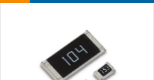
TE Part #1-2176339-5 CRGCQ 0603 150R 1%