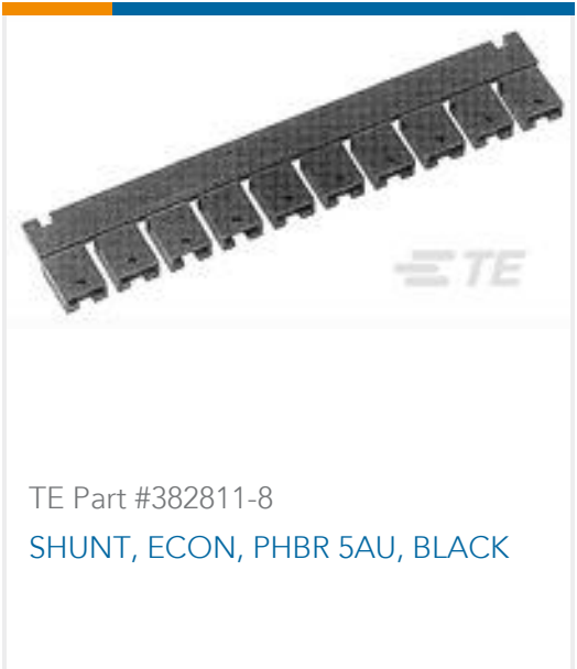
TE Part #382811-8 SHUNT, ECON, PHBR 5AU, BLACK