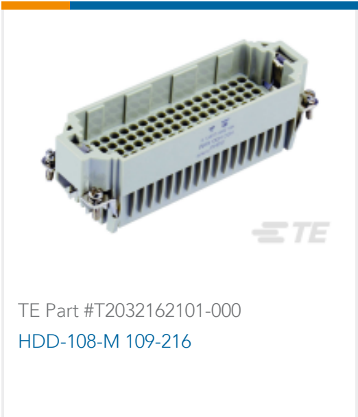
TE Part #T2032162101-000 HDD-108-M 109-216