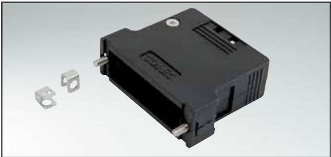
RoHS compliant – CSA listed, File No.: LR 115000-1 – UL listed, File No.: E202784

Straight cable entry – 9, 25 and 37 pos. – Flat mounting style