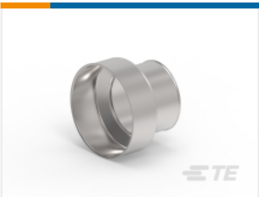
TE Part #1670813-2 EMC, CRIMP SLEEVE, IPT 70 - 12