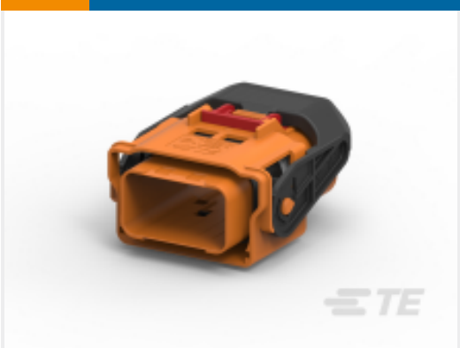
TE Part #2141608-4 5POS,AMP MCP6.3/4.8K,REC HSG,A