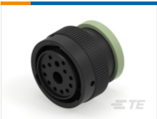
TE Part #HDP26-24-14SN-L017 PLG, 14P, BLK, N, RNG, 4/12/16, S