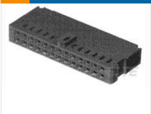
TE Part #102387-4 20 MODIV HSG COMP DR .100 POL