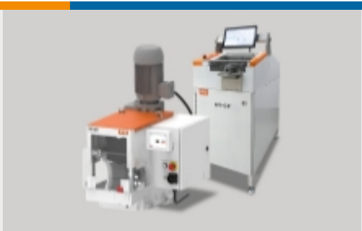
High Voltage Wire Processing Equipment(9)