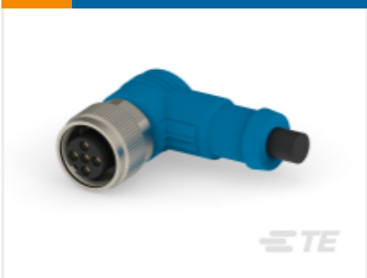
TE Part #T4161410005-002 RPC-M12-FR-5CON-PVC-1.0SH