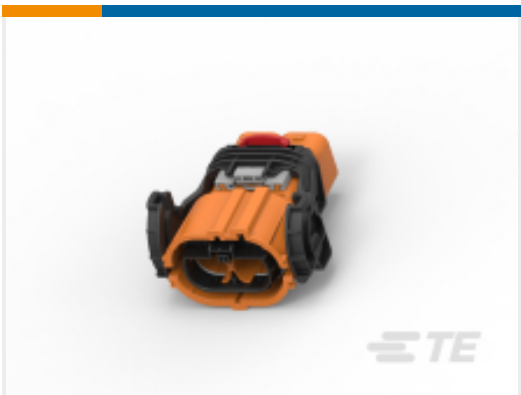
TE Part #1-2177053-2 2POS,8MM HV,PLUG HSG,ASSY, SEALED