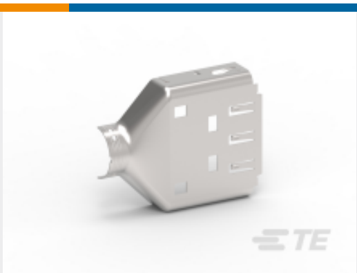
TE Part #2141616-1 SHIELDING, 5+2 POS HV CONN