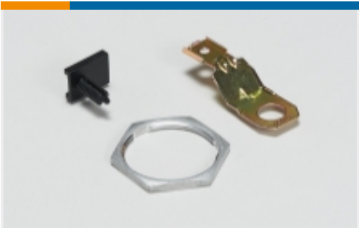
Other Automotive Connector Accessories(1)