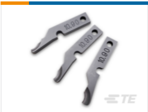
TE Part #2364113-7 KIT, BLADE, CONTOUR