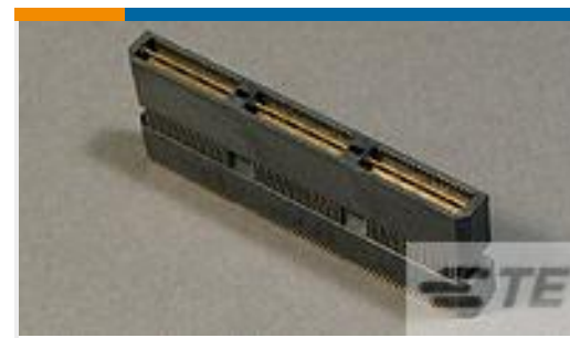
TE Part # 1658049-3 MSB0.80PL22ASY120FL,-,F,-TY