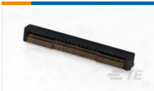
TE Part #2057630-1 CFP Receptacle Conn Assy