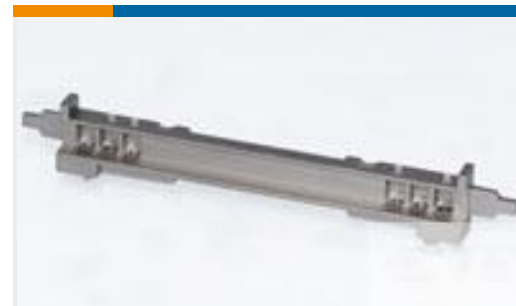
TE Part #2057592-2 CFP Guide Rail