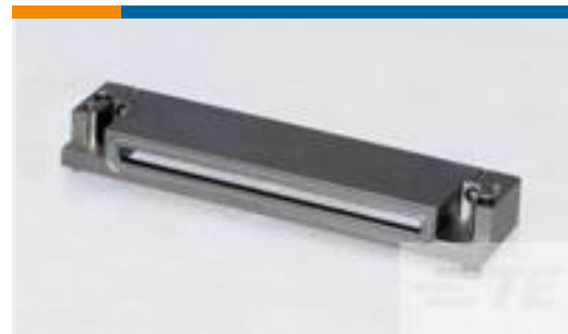
TE Part #2057631-1 CFP Receptacle Cover Assy