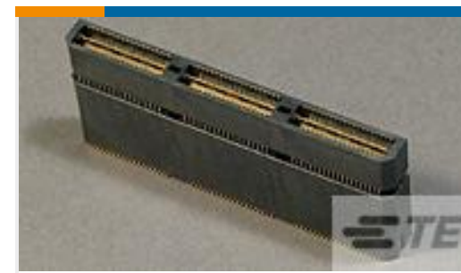
TE Part # 1658050-3 MSB0.80PL25ASY120FL,-,F,-TY