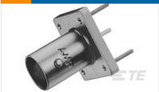
TE Part #5227699-1 BNC PCB VERTICAL