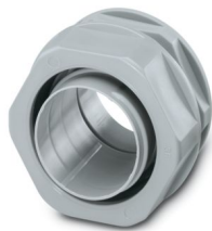
Cable gland made from PP with Pg thread, IP65 protection

Please be informed that the data shown in this PDF document is generated from our online catalog. Please find the complete data in the user documentation. Our general terms of use for downloads are valid.